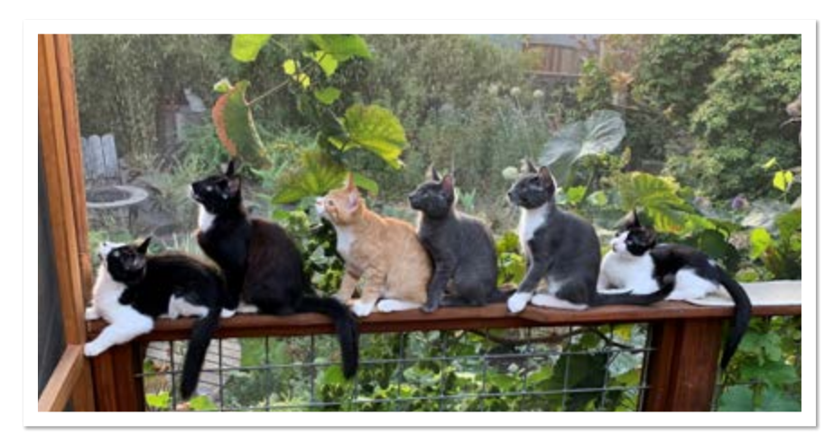
SIX KITTENS ON A BUG HUNT

"We already had a 12'x12' deck so we decided to enclose the whole thing to serve as a catio, "says Roger. "I wanted to avoid it feeling like a big cage so I used pet-proof screening that didn't affect our view of the back yard