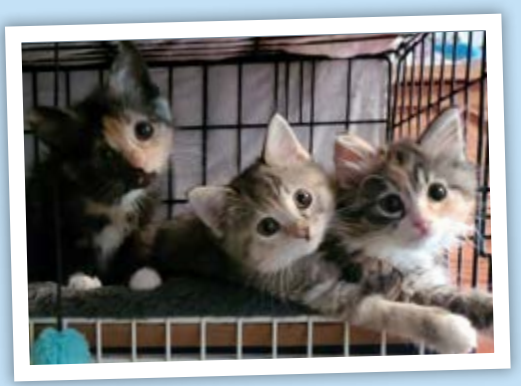
BABIES JUNO, JOSETTE, & JAMILA

Three beautiful girl kittens were found in a backyard last winter. We never move kittens unless we know the momcat is not returning, so we kept watching for her. We finally brought the kittens in from the cold and, although we kept monitoring for weeks, their mother never returned. We named the kittens Juno, Josette, and Jamila. They grew healthy and