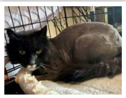
FROM TOP: LINCOLN; CHLOE; QUIMBY; MONTE