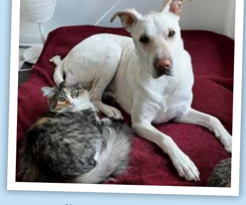
MUNCHBOX & SNACKY CHAN

strong under the care of our foster volunteers. When it was time for their spay surgeries, Aimee was on duty at the vet and before the day was over, we received Aimee's message